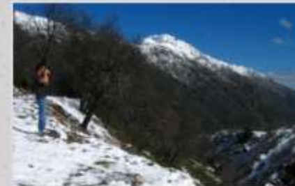
GRADUATE FELLOWSHIPS AND TRAVEL AWARDS FOR INTERNATIONAL COLLABORATION

Grants to participate WSC-SAVI relevant U.S. graduate and postdoctoral training, such as the GLEON Graduate Fellowship Program .