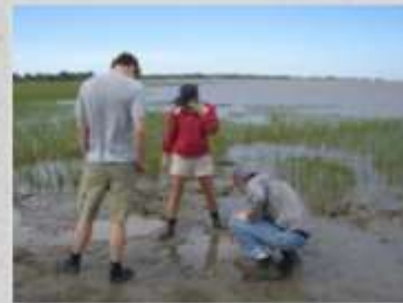
GRADUATE & EARLY CAREER TRAINING PROGRAMS!

Travel awards are available to U.S. investigators and students to support participation in GLEON or SAFER meetings and workshops. NOTE: GLEON and SAFER