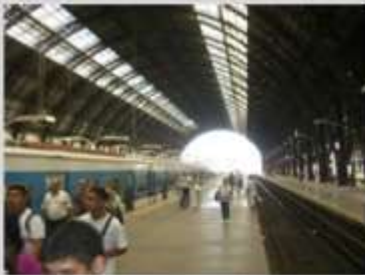
TRAVEL AWARDS for SAFER & GLEON Meetings!

Travel awards are available to U.S. investigators and students to support participation in GLEON or SAFER meetings and workshops. NOTE: GLEON and SAFER