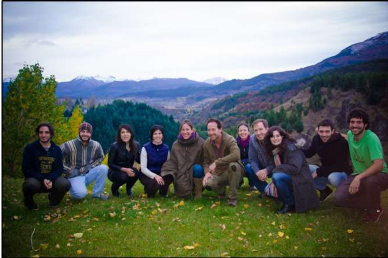
First SAFER graduate training workshop Coihaique, Chile May 1-6, 2014